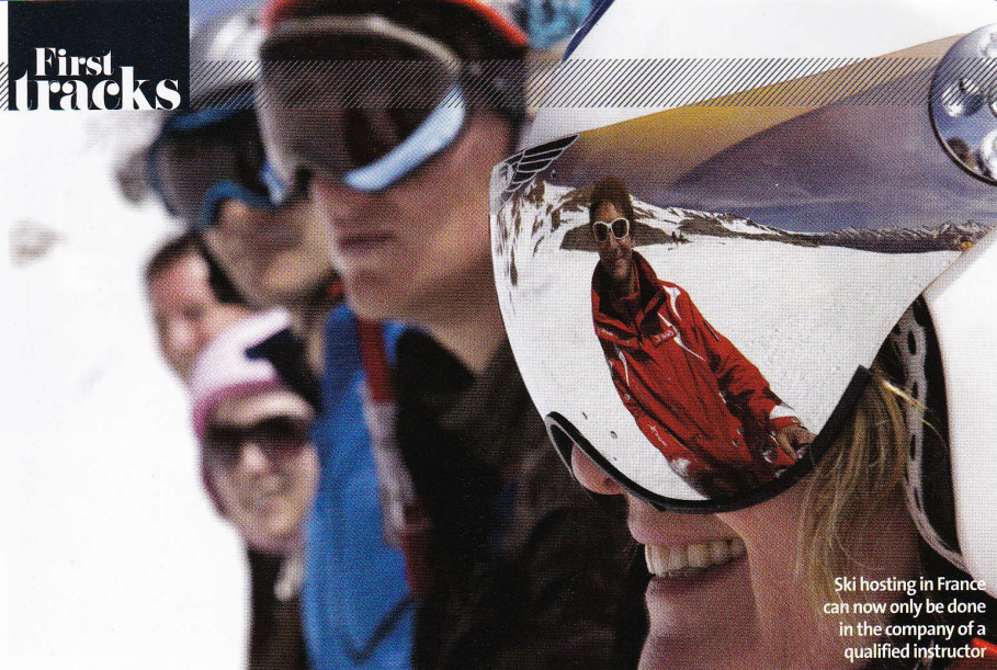
Ski hosting in France can now only be done in the company of a qualified instructor